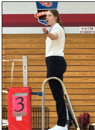
New officials training at Fond du Lac High School the week between Christmas and New Year's was a huge success.

July 29-30: Badger Region Beach Championships at Bradford Beach in Milwaukee