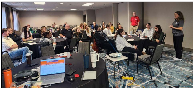
New officials stuck around for their own in-person meeting to go over things after the full meeting adjourned.