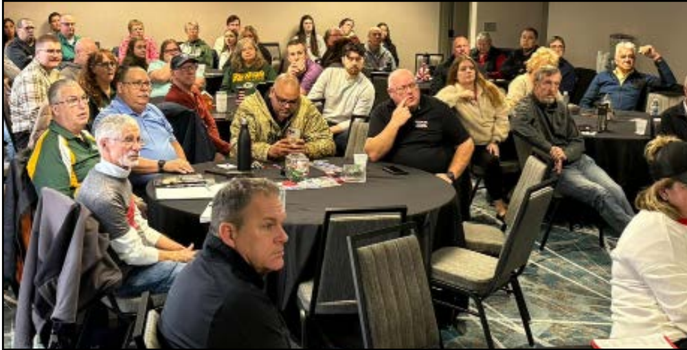
A combination of new and experience officials came to the Brookfield Sheraton Sunday for our first in-person ref meeting of the year. Another meeting is set for Dec. 8. And an online meeting is set for Dec. 10.

WWW.BADGERVOLLEYBALL.ORG | MEMBERSHIP@BADGERVOLLEYBALL.ORG